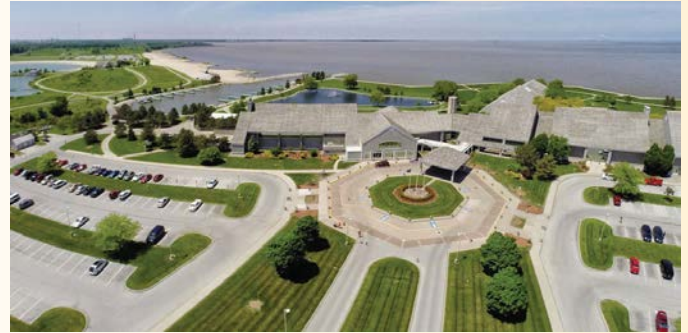
Maumee Bay State Park

Oregon, Ohio is a close-knit community that is a major growth area for the Toledo metropolitan vicinity. It is located on the Maumee Bay of Lake Erie, a popular recreational area for boating, fishing, etc. It is a very livable community with a pleasant mix of residential and business. Mean income is $52,780, median age is 43 and average home value is $164,000. Excellent public and private schools are located in and around Oregon. The University of