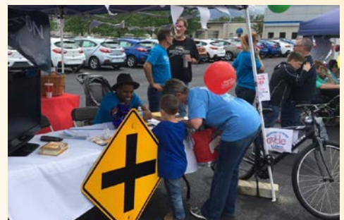
Intersection Church booth at 2017 Oregonfest

Pastoral applicants must be credentialed Open Bible ministers in good standing. The church is willing to be patient for the credentialing process for the right, willing pastoral candidate. A selected pastoral candidate must also sign Open Bible Churches' Pastoral Covenant of Relationship. All applicants will be screened for eligibility and must agree to background checks that will be performed as part of the screening process. Submit all inquiries and questions to the regional and district directors.