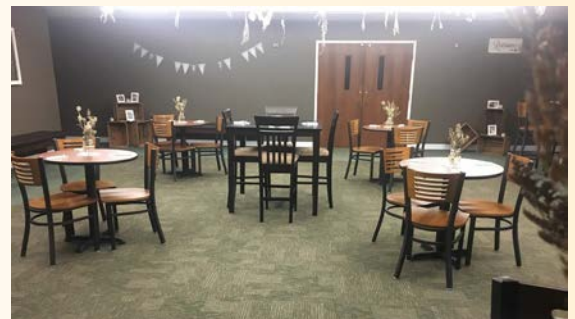
Intersection Church Foyer

Intersection is evangelical in outlook and has recently become accustomed to manifestation of the Holy Spirit and desires a deeper understanding and movement in this area. Worship is a blend of contemporary music led by a 4-6 member worship team. The church facility has a contemporary, inviting look and feel. The sanctuary will seat over 400 people. A coffee nook has recently been added where people can gather before or after services. A small gym/multi-purpose facility is used quite often for potlucks, showers, ministry, basketball, etc. The property is