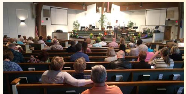
Intersection Church Sunday morning service

Intersection's next pastor should have experience as a lead or associate pastor. Our desire is for both the pastor and the pastor's spouse to be relational as well as being led by the Holy Spirit. We identify the following priority characteristics as important for our next pastor to possess: