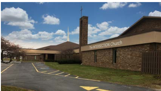
1640 South Coy in Oregon, Ohio

January, 2017 that is serving the community needs as well.