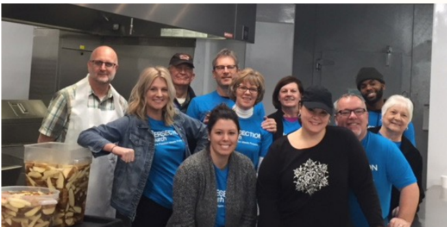
Serving at Cherry Street Mission

The church core is resolute in our support for each other, love for the church and determination to help the church move into a deeper calling in Oregon and surrounding communities. We are not content with status quo and have a vision for Intersection to possess a sovereign, distinct role to play in reaching the greater Toledo area for Christ. We are eager to grow in ministry impact in our neighborhoods. Visitors are frequently present. The facility has recently been redecorated and refreshed by new paint and has an updated, comfortable look and design. All classrooms